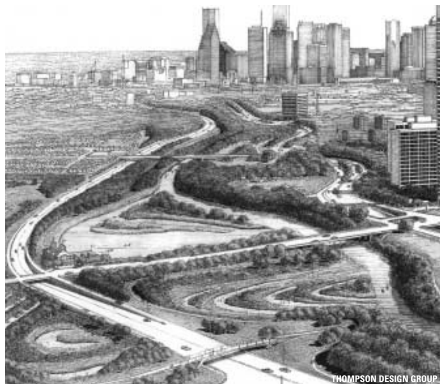
Reconfiguring the Waugh/Heights and Memorial Drive intersection (from a cloverleaf to a diamond intersection, above) will open an additional 20 acres of park space to accommodate parking, additional recreational area at Spotts Park and a boat house.