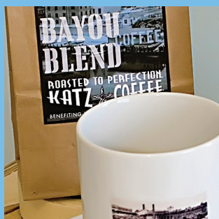
Bayou Blend Coffee